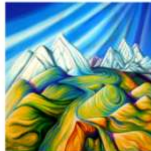
Majestic Mountains By: Timothy Sorsdahl

Offer valid 3/1/10 - 3/31/10 Cannot be combined with any other offer or discount While supplies last